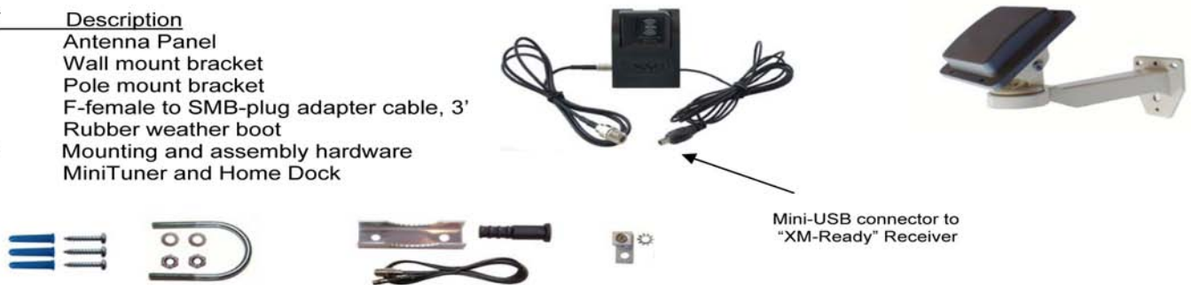
Figure 1: Included Items