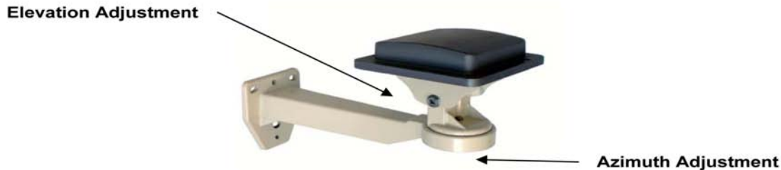
Figure 2: Elevation and Azimuth Adjustments

Attach the wall mount assembly to any vertical or horizontal flat surface. Use the supplied screws to secure the mount in the position desired (use of the included anchors requires 5/16" holes).